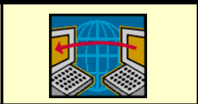
5500 Filings "On-Line"